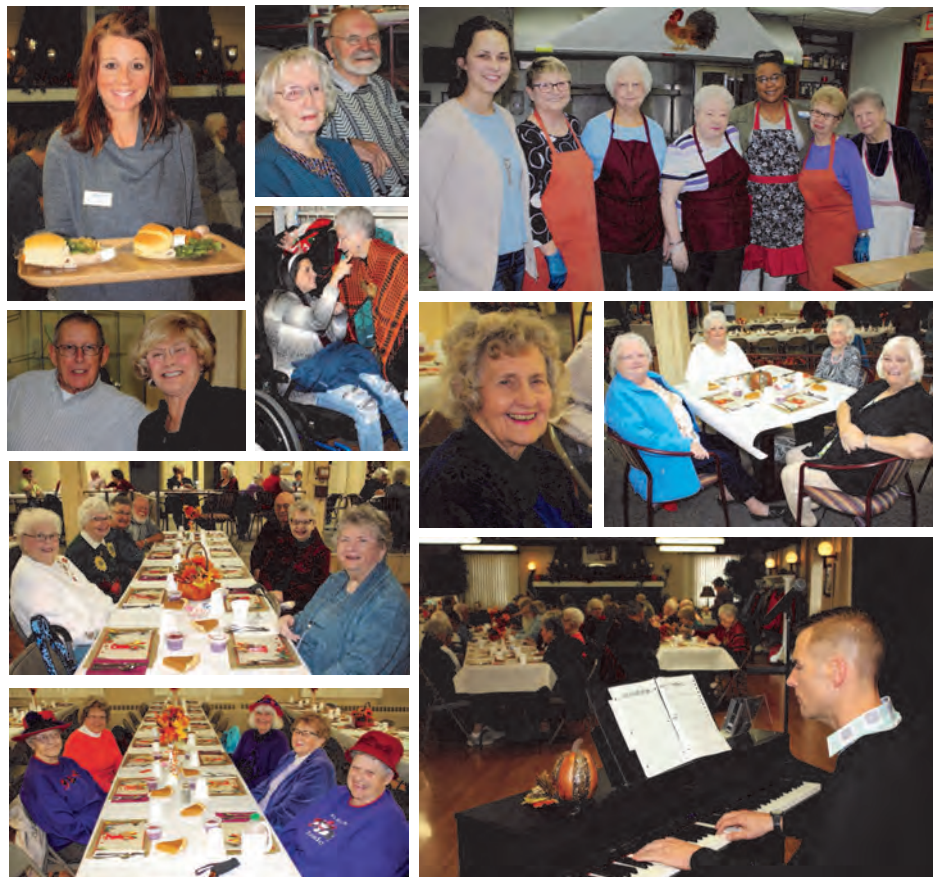
225 members and guests enjoyed our Thanksgiving Dinner, sponsored by Beltone.

Hosted on the first Friday of every even month at 11:30 am . All new members from the previous month are invited to join staff & volunteers for a free lunch, compliments of Primrose Retirement Communities . Our next New Member Mixer is Friday, December 1 .