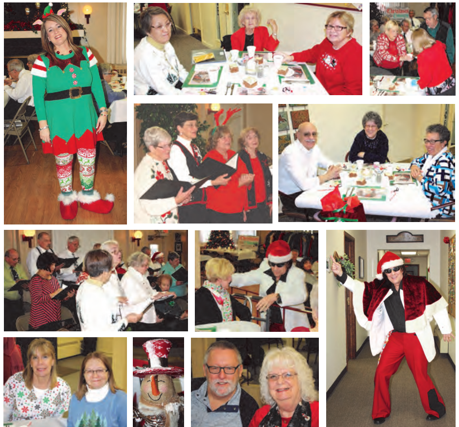
220 members and guests enjoyed our Christmas Dinner, sponsored by Brookdale.

Hosted on the first Friday of every even month at 11:30 am . All new members from the previous month are invited to join staff & volunteers for a free lunch, compliments of Primrose Retirement Communities . Our next New Member Mixer is Friday, February 2 .