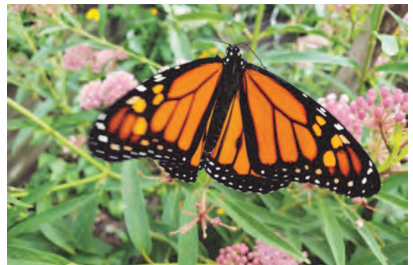
'Before' (chrysalis) and 'After' (monarch butterfly) photos from our terrarium.